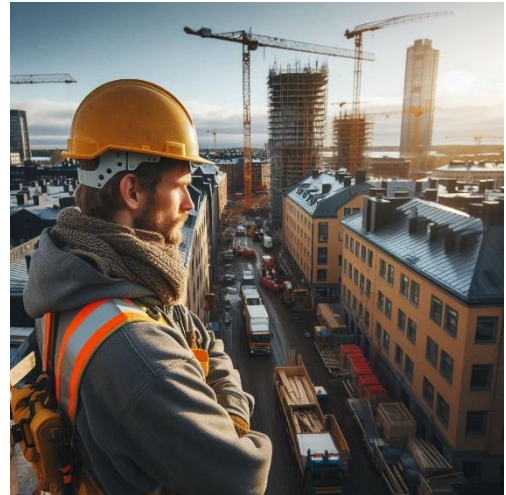
Created with AI on 26.9.2024.