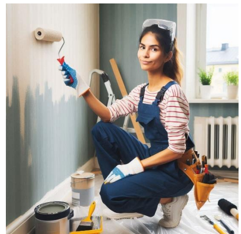
Created with AI on 26.9.2024.