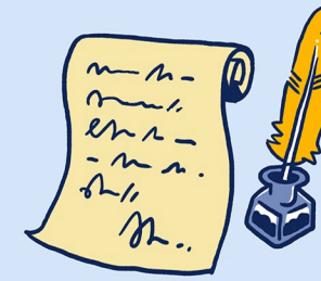
Expectations for tone and style of the answer