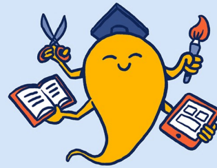
It's role and job