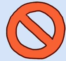
Constraints and restrictions